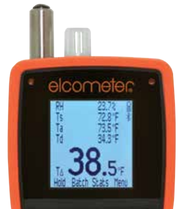
View up to 5 user selectable statistics on screen