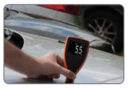
Measures on steel & aluminium body panels <sup>2</sup>

Switches instantly to measure coatings on steel & aluminium<sup>2</sup>